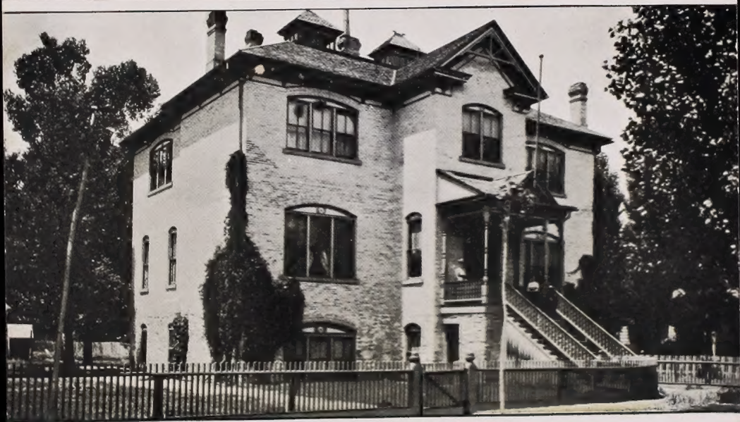
NEW JERSEY ACADEMY, LOGAN, UTAH.